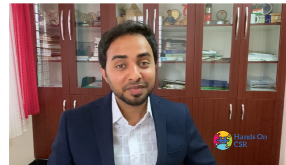
Unspent CSR Money

Youtube Video explaining “CSR amendment” was published on January 26th, 2021 which got a good response from the audience.