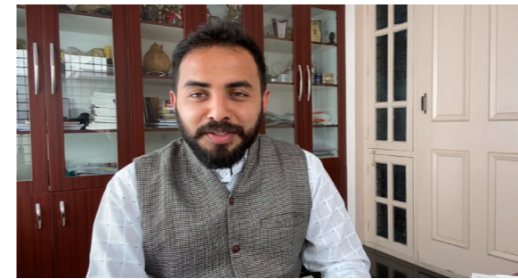
CSR law Amendment 2021 Explained