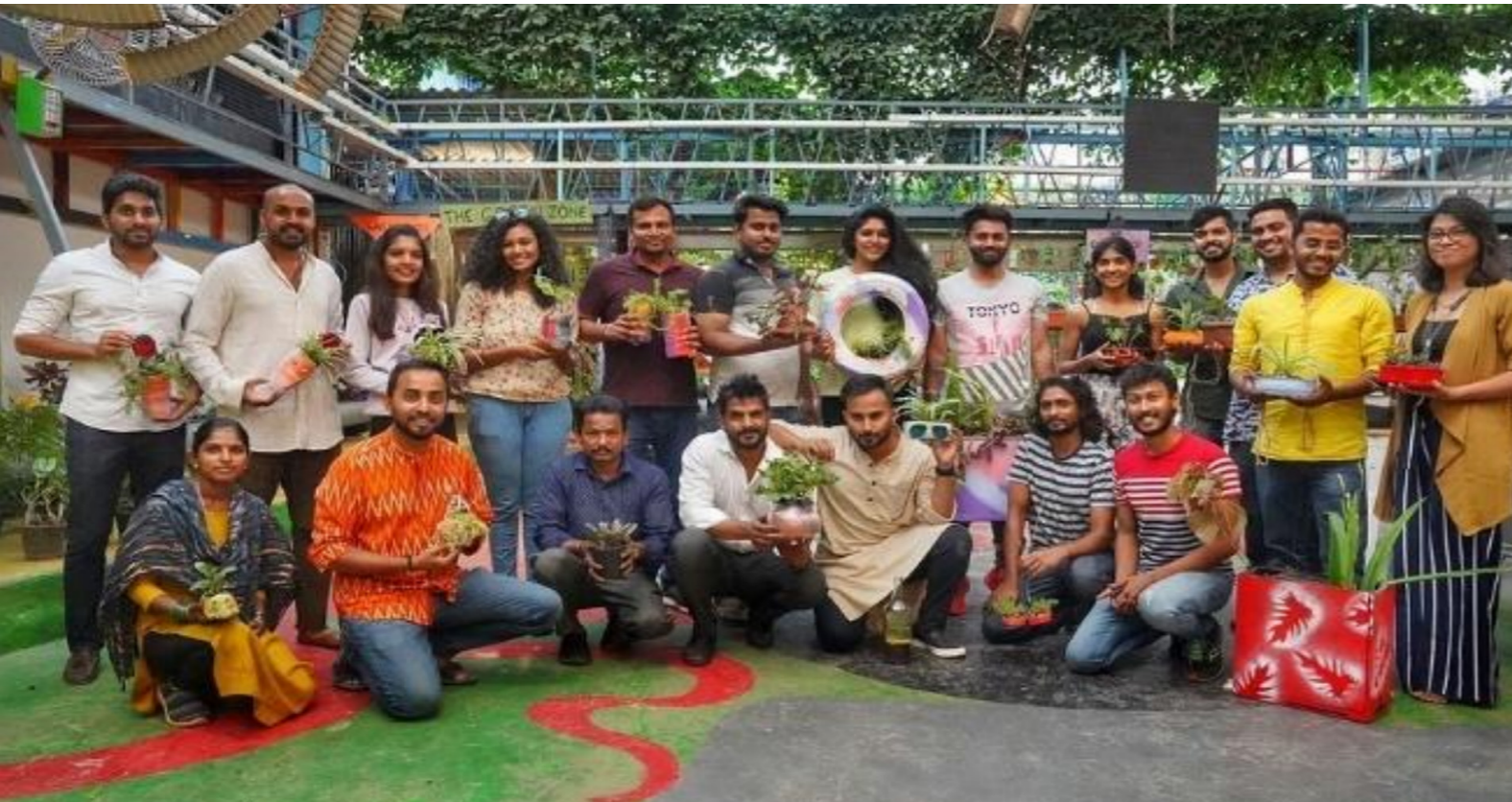
Participated in Upcycling and greening event by Bangalore Creative Circus