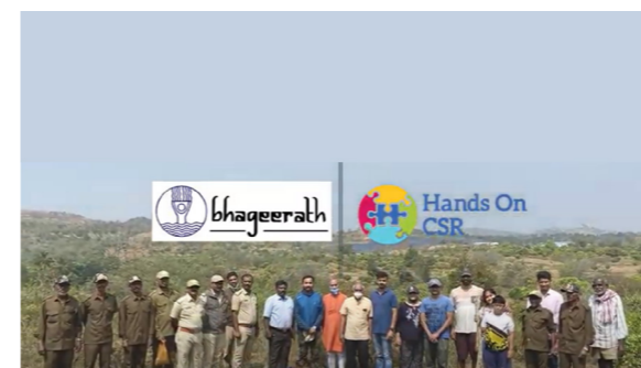
Planting Banyan tree

Youtube video on “Unspent CSR Money” was published on March 20, 2021.